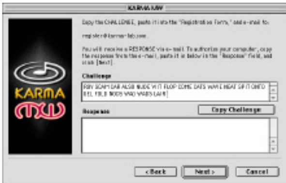
Mac Authorization Dialog

KARMA MW is copy-protected software. It requires an “authorization” to run on your computer. On Mac, locate and double-click the KARMA MW icon (in the KARMA MW folder installed by the Installer). On Windows, choose the KARMA MW shortcut on the desktop. The first time you launch the application several dialogs will appear, taking you through the authorization process.