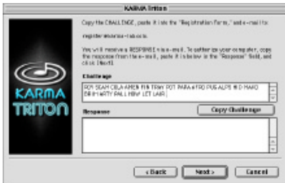
Mac Authorization Dialog

KARMA Triton is copy-protected software. It requires an “authorization” to run on your computer. On Mac, locate and double-click the KARMA Triton icon (in the KARMA Triton folder installed by the Installer). On Windows, choose the KARMA Triton shortcut on the desktop. The first time you launch the application several dialogs will appear, taking you through the authorization process.